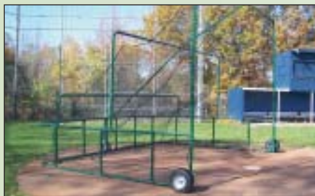
Cage is powder coated green.