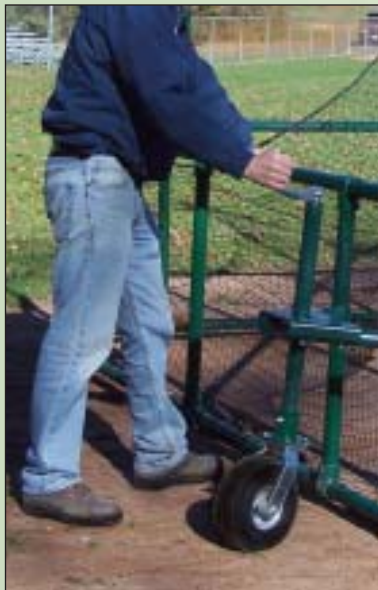
Easy to transport cage for perfect placement. New hand crank lifts cage quick and easy.