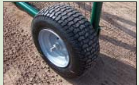
New and improved pneumatic wheels for smooth and easy transporting.