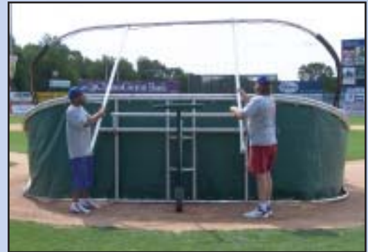
Easy to fold and collapse for transport or storage.