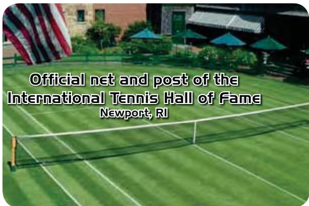
Official net and post of the International Tennis Hall of Fame Newport, RI