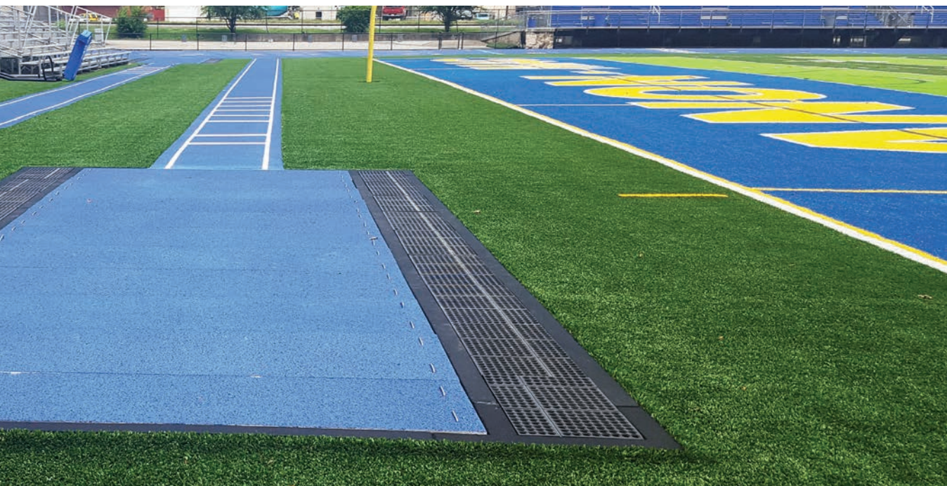
LONG JUMP PIT SYSTEM

concrete forming is required. The pieces pin or glue directly to the sub grade and are connected to each other with a high-strength industrial adhesive.