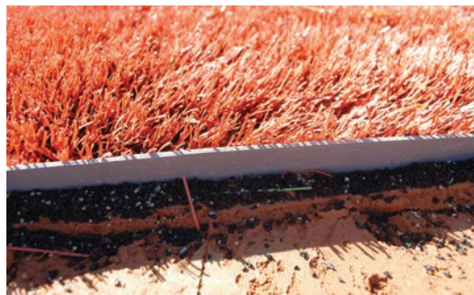
BASEBALL DIVIDER CURB

FlexEdge Rubber Baseball Divider solves these issues with a complete kit for assembling and installing an affordable and easy to install divider. The Baseball Divider can be used along sidelines, at warning tracks and at the halo behind home plate. The pitchers' mound kit